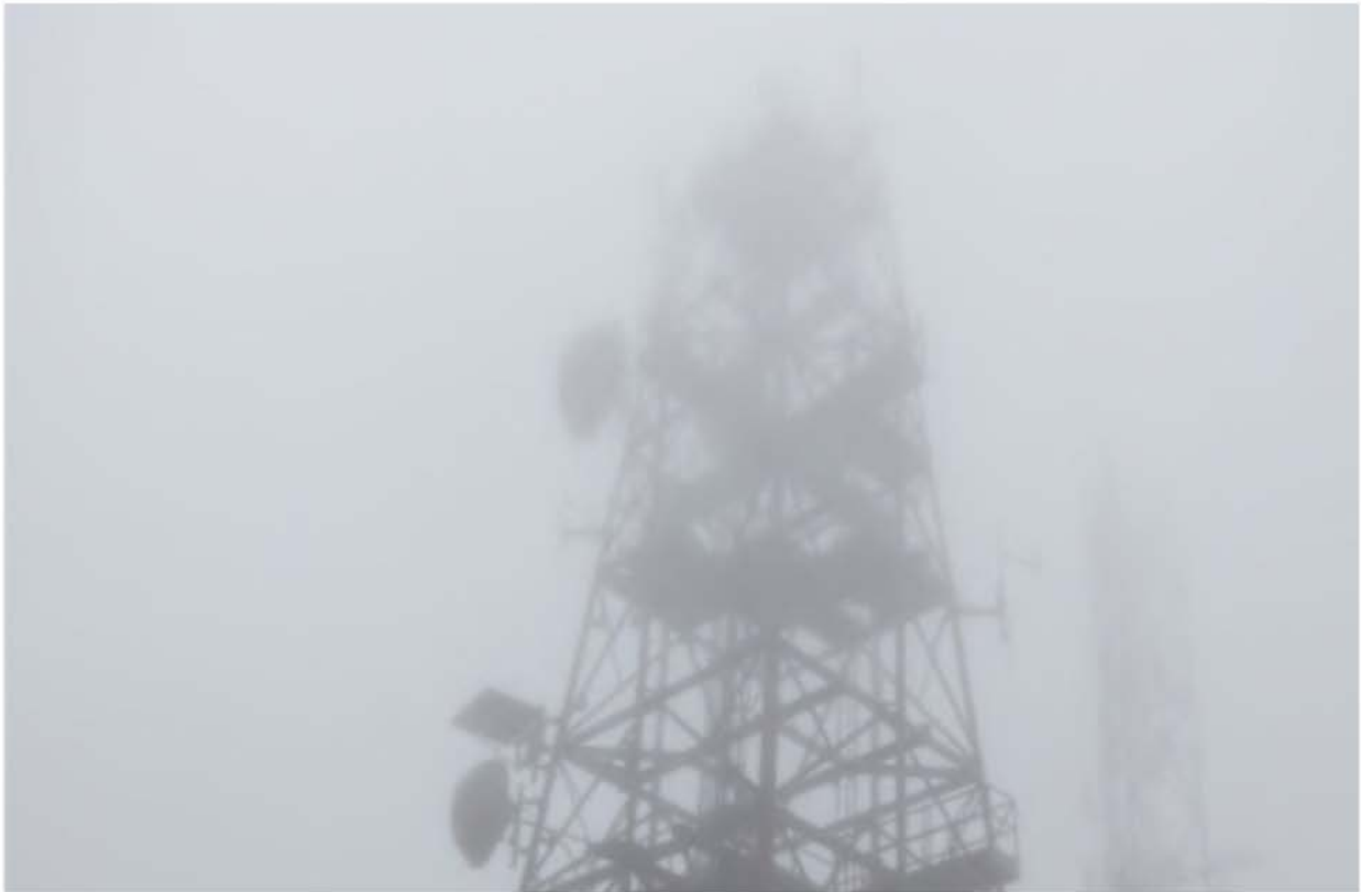
The Bear Mtn. Repeater It's there, just a little foggy!