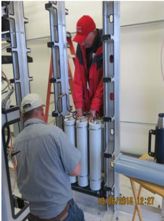
Two LCSARO volunteers installing filters