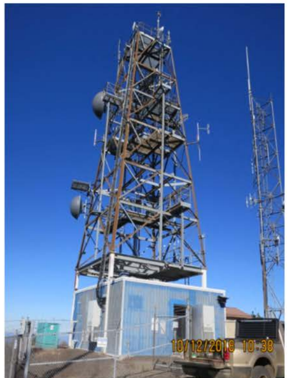
The Bear Mtn. Repeater in Lane County on a beautiful day