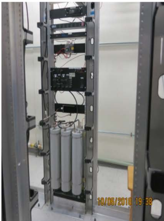
The completed installation